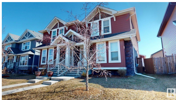
1083 Watt Promenade SW Edmonton